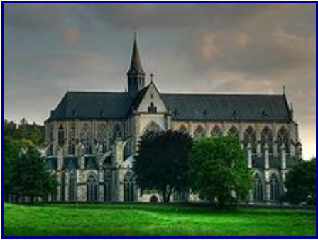
Former abbey church of Altenberg Abbey, now known as the Altenberger Dom.