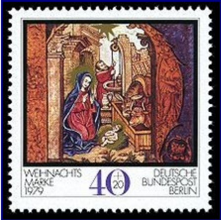
Birth of Christ: detail of the initial letter "H" from a manuscript of Altenberg Abbey, on the Berlin Christmas stamp of 1979.